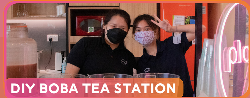
DIY BOBA TEA STATION