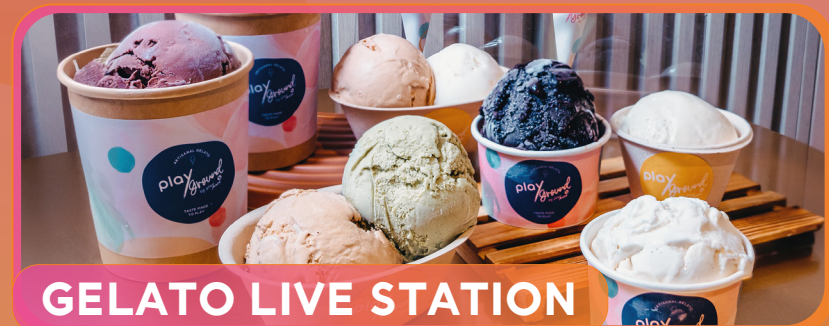
GELATO LIVE STATION