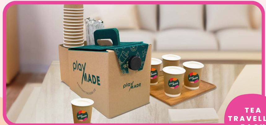
TEA TRAVELLER PACK