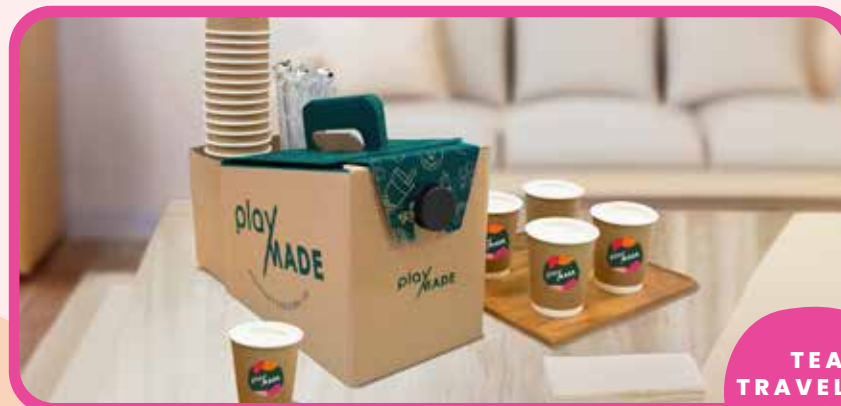
TEA TRAVELLER PACK